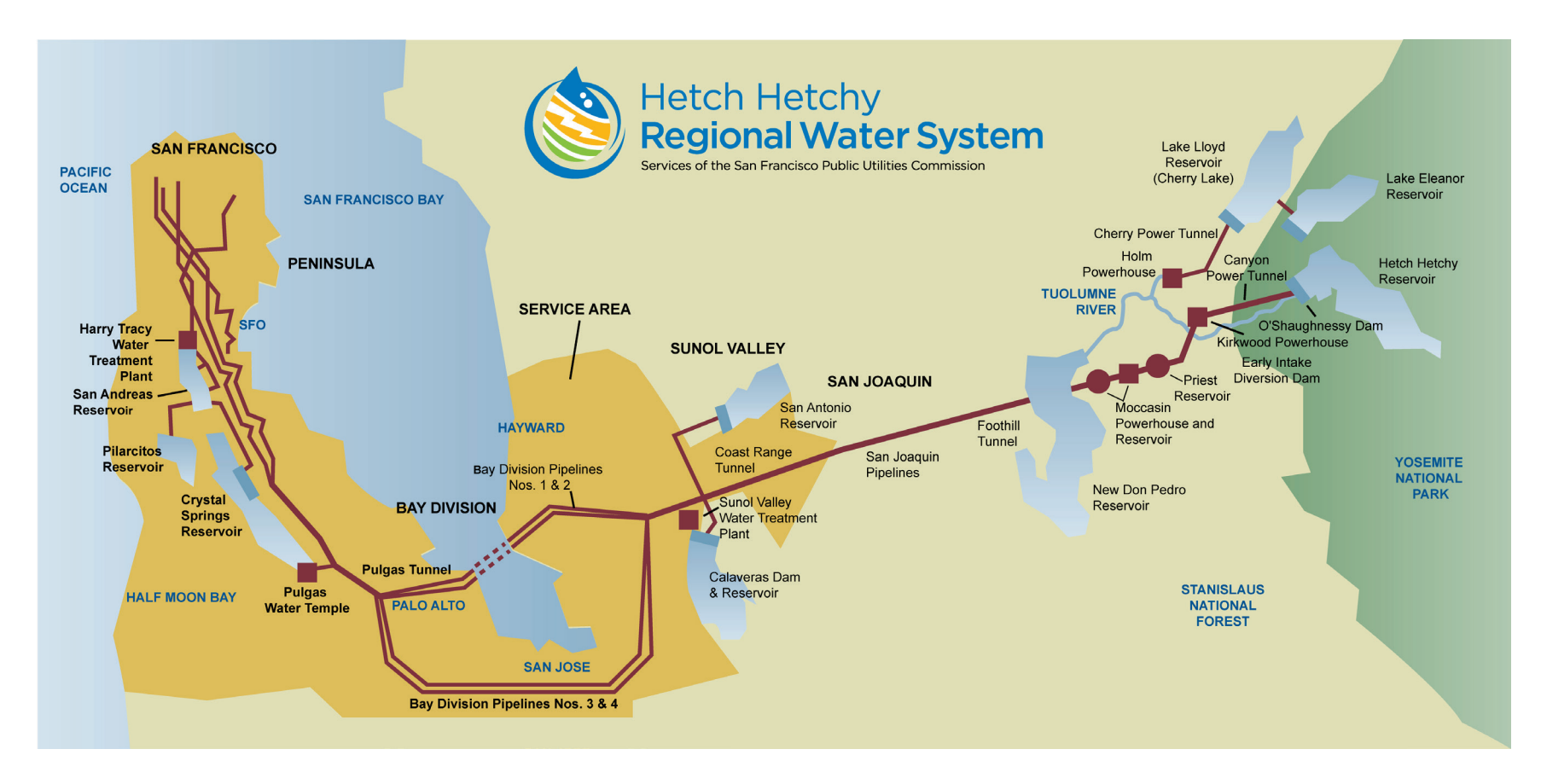
Figure 1-1 (Not to Scale) – The above map depicts the Hetch Hetchy Regional Water System. For further description of the SFPUC's Water System, see "THE WATER ENTERPRISE."

The 2015 Series A Bonds are not secured by a legal or equitable pledge of, or charge, lien or encumbrance upon, any of the property of the SFPUC or any of its income or receipts, except Revenues. See "SECURITY FOR THE BONDS."